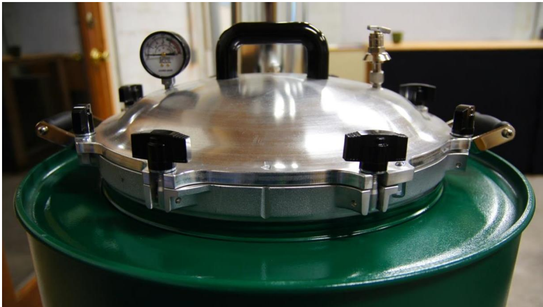
Adapter Ring Installed in a 60 Liter Stove

Installation and Use: Insert the adapter ring into the stove when the autoclave is to be used, as shown above. Place the autoclave into the stove with adapter ring installed. Operate the stove as you would normally.